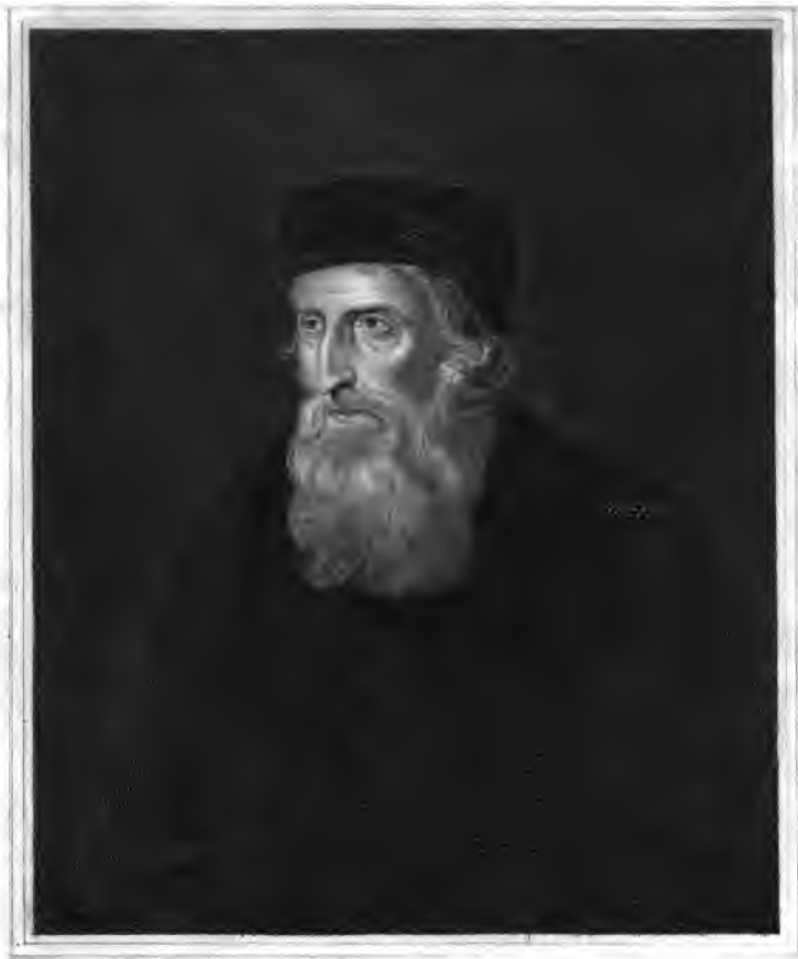
JOHN de WYCLIFFE, D.D.