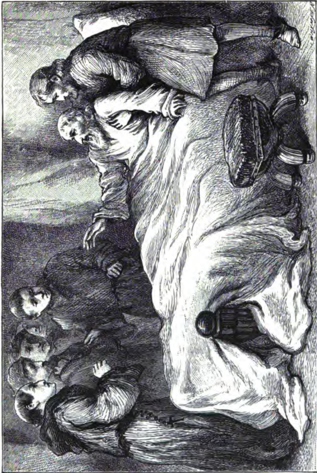
WYCLIFFE AND THE FRIARS.