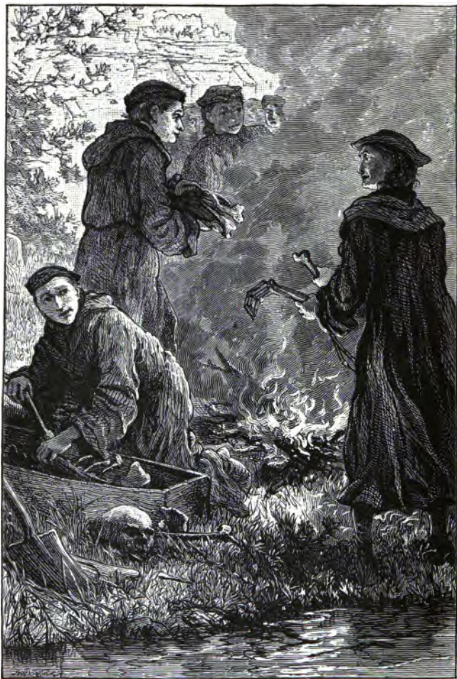
THE BURNING OF WYCLIFFE'S BONES.