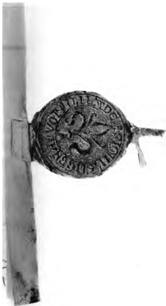
CONVEYANCE OF LAND IN CAT-STREET, OXFORD (? 1170-1180 A.D.)